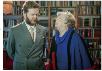
Ragnar Kjartansson, Me and My Mother , 2015.