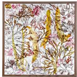
Astrid Krogh, Seaweed Of The Universe , 2021