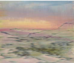
Hildur Ásgeirsdóttir Jónsson, Various Landscape #15 , 2023