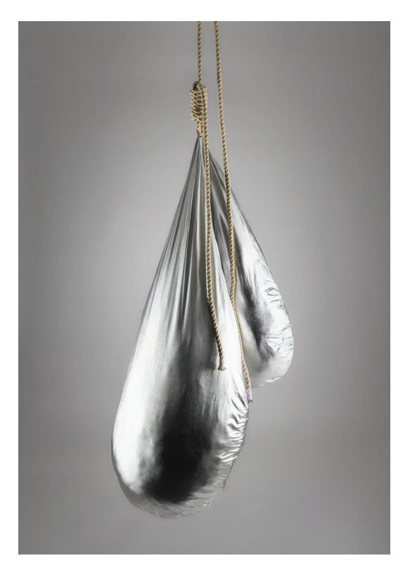
3. Randi Samsonsen DROP DEAD GORGEOUS BALLS, 2021 Textile 1.5 (h) x 2 (p) m; ca. 4 kg