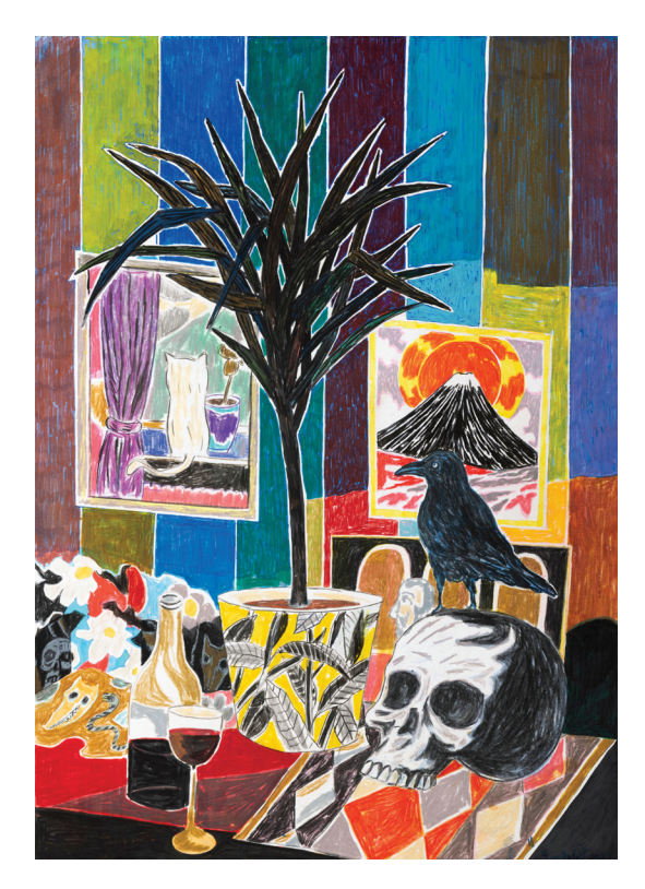
7. Hanni Bjartalíð Untitled , 2023 Drawing on paper 76 x 56 cm