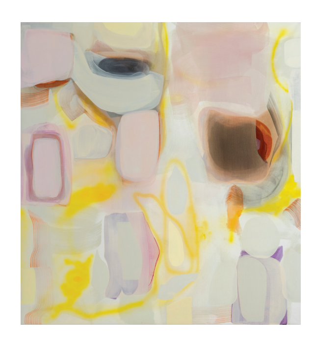
1. Hansina Iversen Purple Rain, 2023 Oil on canvas 170 x 160 x 2 cm

APRIL 13 THROUGH JULY 6, 2024 Scandinavia House | 58 Park Avenue, New York, NY 10016