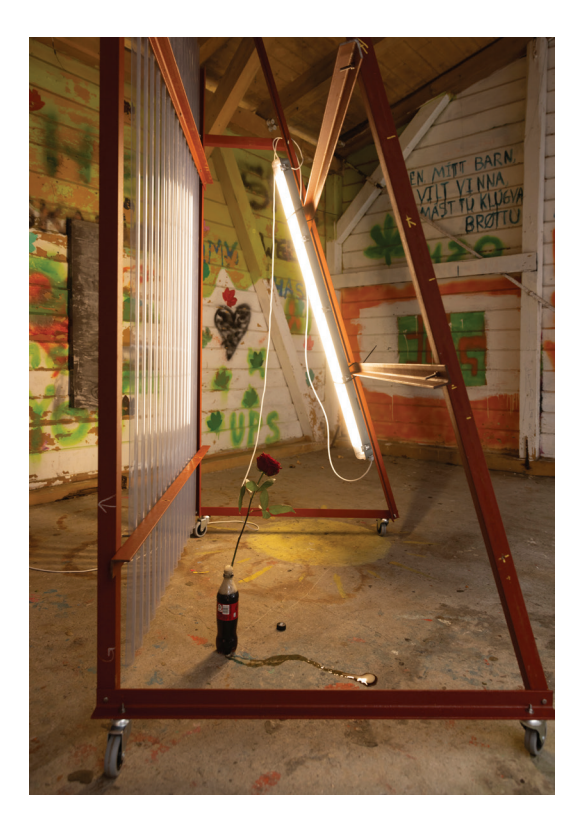
4. Jóhan Martin Christiansen Don't tell me cause it hurts, 2023 Sculpture steel, plastic, wheels, fluorescent tube, wires, Coca Cola Zero bottle, red rose