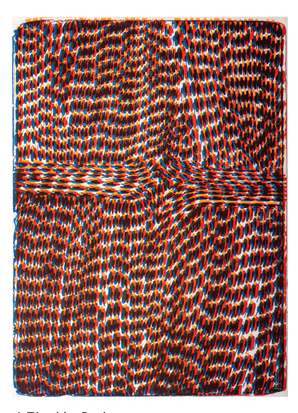
6. Tóroddur Poulsen Wavelengths, 2023 Lithograph 90 x 80 cm