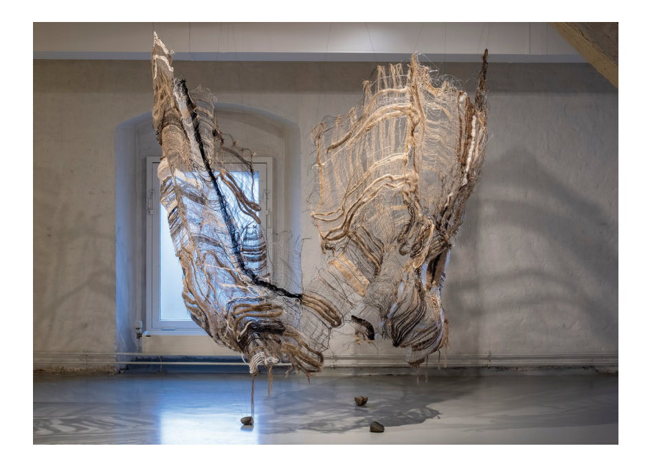
2. Alda Mohr Eyðunardóttir to change what was intended..., 2020 Stone, linen, silk, wool, steel wire and nylon wire 250 x 250 x 300 cm