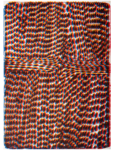
Tóroddur Poulsen, Wavelengths, 2023