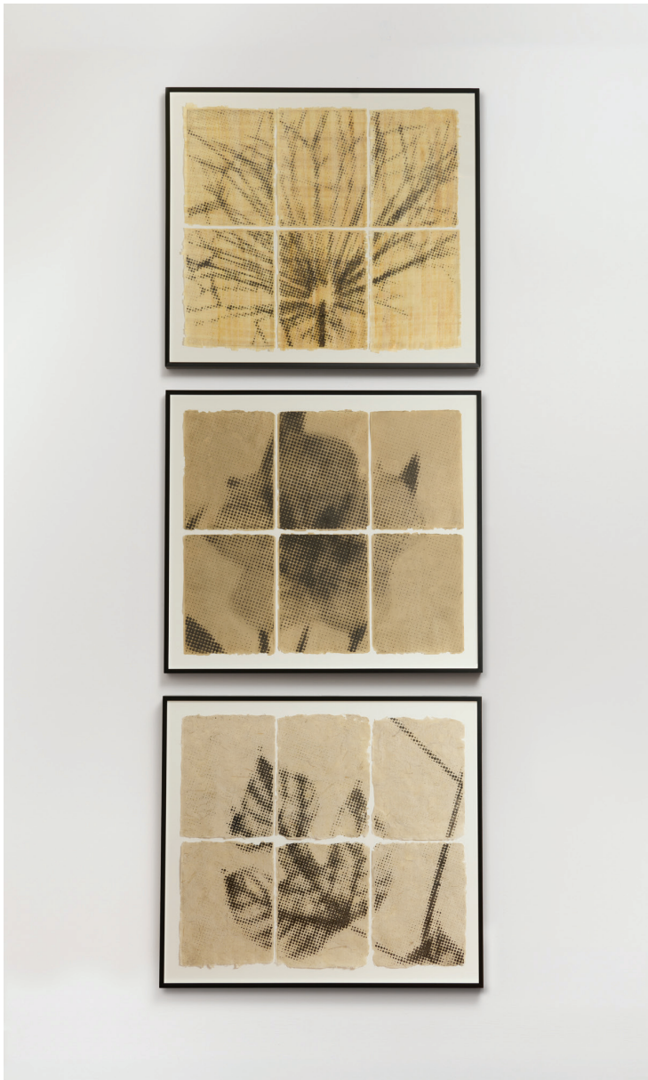
11. Katrín Sigurdardóttir (IC) Untitled (Broussonetia Papyrifera), Untitled (Linum Usitatissimum), Untitled (Cyperus Papyrus) 2025 37 x 42 in (respectively) Monotype on handmade papyrus/linen/kozo (respectively) Ed 5/+2 Courtesy of the artist Image credit Chromatics Studio NYC