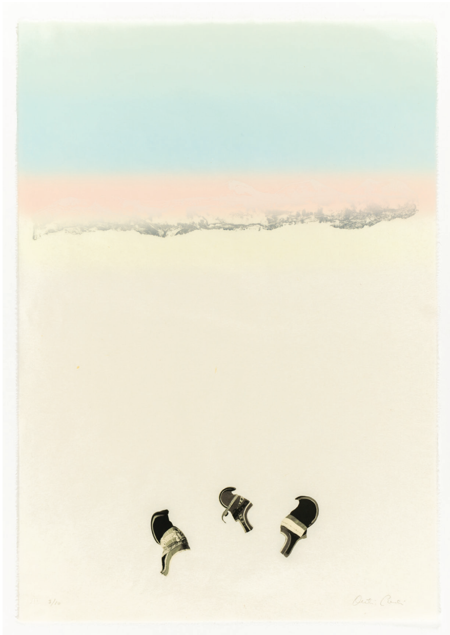
13. Outi Pieski (Sapmi/FI) Golbma oabbaža / Three Sisters , 2018 Six-color lithograph with chine collé Collaborating Printer(s): Valpuri Remling Edition of 10 Printed and published by Tamarind Institute