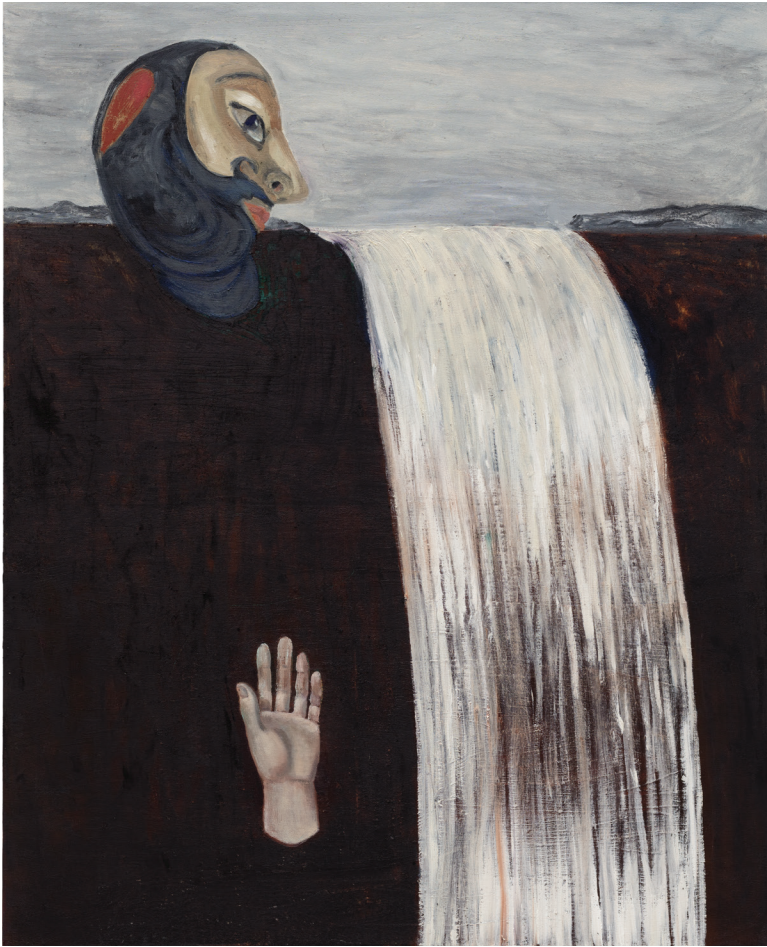
5. Mamma Andersson (SE) Tröst / Solace , 2024 Oil on canvas 41 1 x 32 in (105 x 80 cm) Courtesy of the artist and Magnus Karlsson Gallery, Stockholm