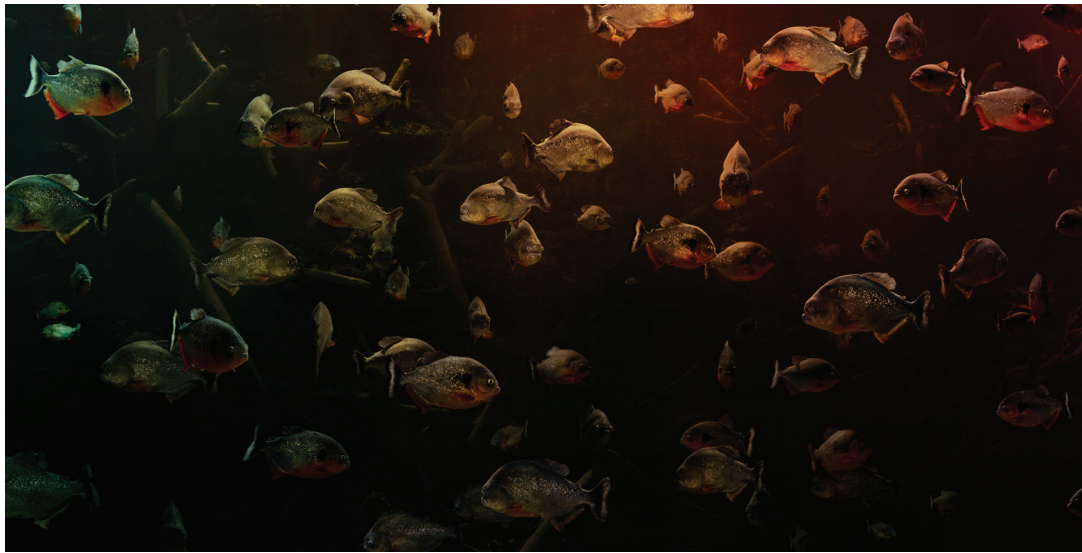
9. Simen Johan (NO) Untitled #201 , 2019 Digital C-Print Image/Paper: 55 x 105 1/4 in (139.5 x 267.5 cm) Framed: 58 x 108 5/16 in (147.5 x 275 cm) Courtesy of the artist and Yossi Milo Gallery, New York