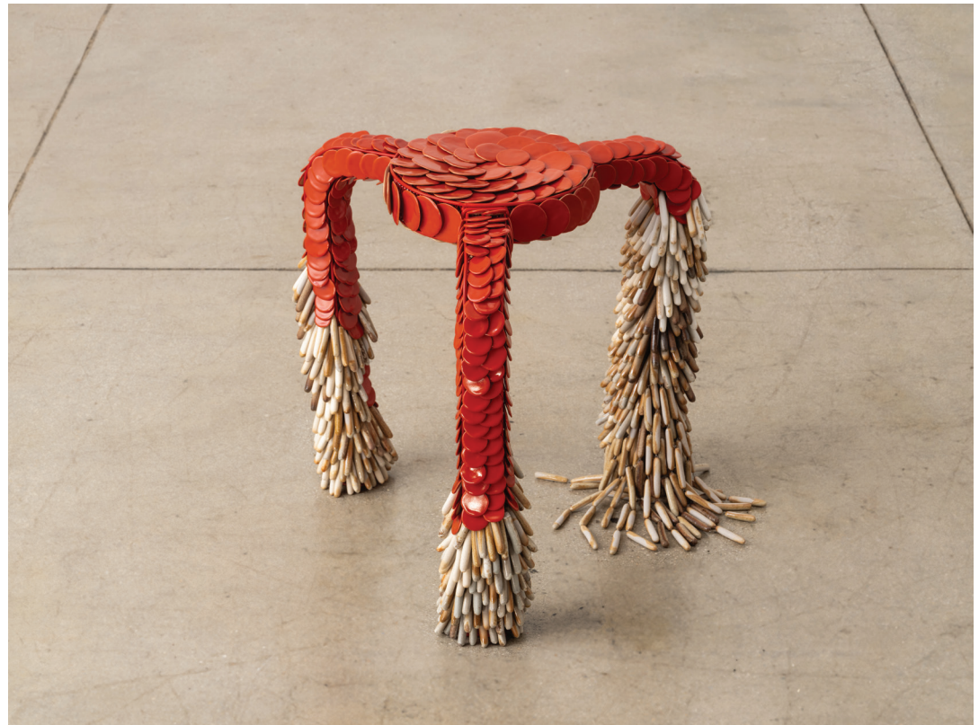
14. Marianne Huotari (FI) Approaching Hibernation , 2023 Glazed stoneware, hand-sewn 18.5 (height) x 19.75 (diameter) in Courtesy of the artist and Hostler Burrows, New York