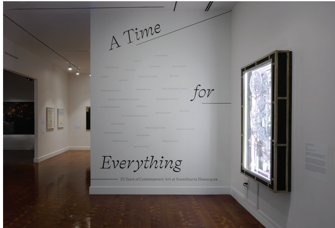
15-22. A Time for Everything at Scandinavia House.