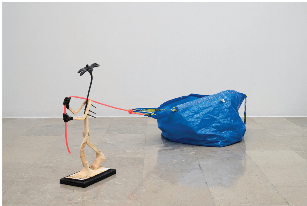
8. Olof Marsja (Sapmi/SE) The Baggage , 2023 Glass, plywood, wood, epoxy clay, IKEA bag, reindeer antler, reindeer skin, aluminium, mirror plate 24 x 59 x 22 in (60 x 150 x 57 cm)