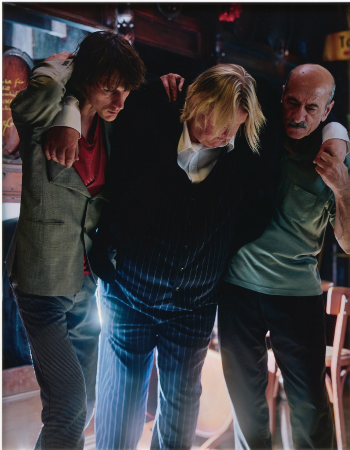
7. Torbjørn Rødland (NO) Bar Scene , 2021 Chromogenic print 30 x 23 5/8 in (76 x 60 cm) Framed: 30 7/8 x 24 1/2 x 1 1/2 in (78.4 x 62.2 x 3.8 cm) Edition of 3, with 1 AP (#1/3)