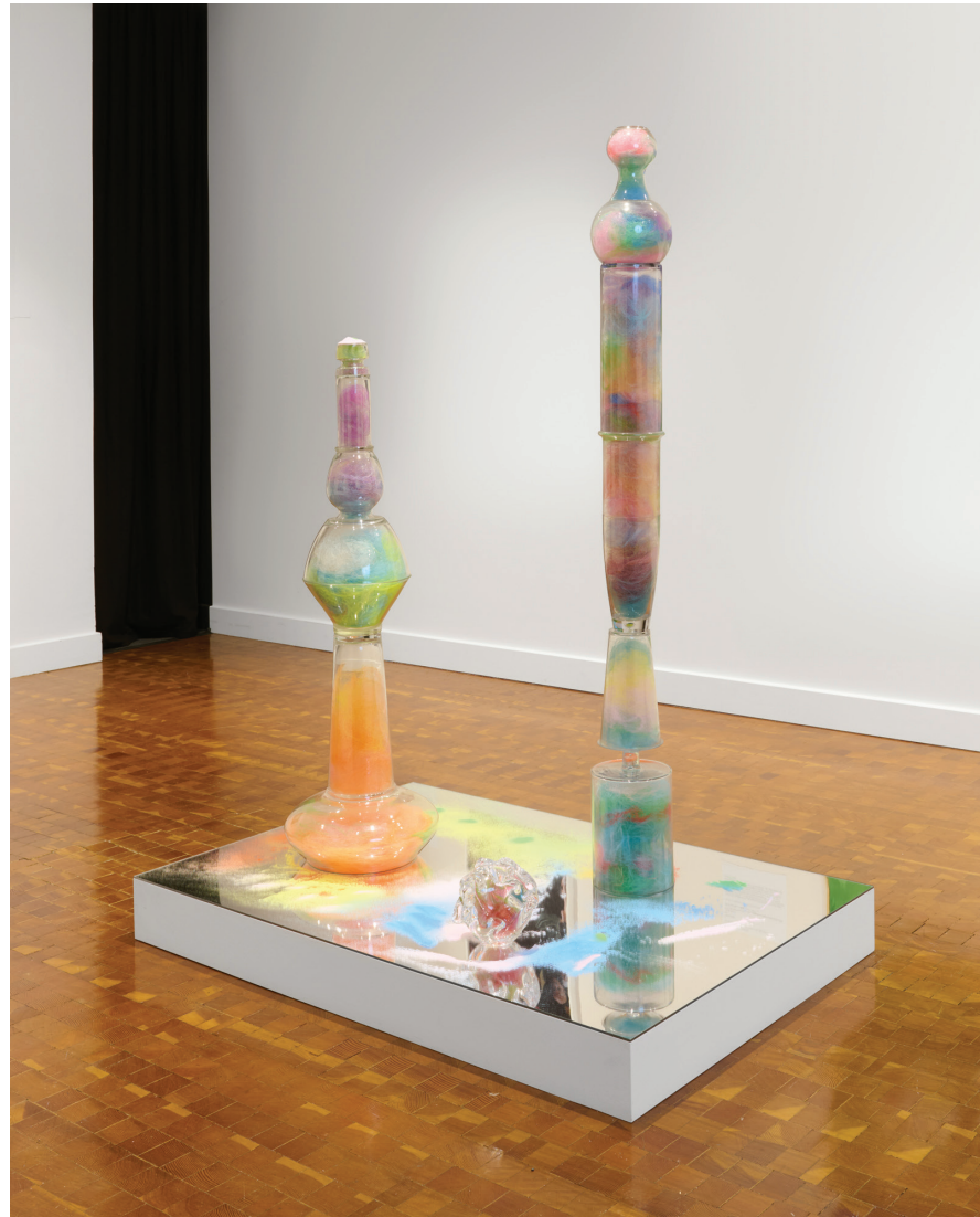
4. Shoplifter / Hrafnhildur Arnasdóttir (IC) Obelia Ballistica I; Obelia Ballistica II 2024 Found glass, synthetic hair Capsule (Cultura Rosea) 2025 Handblown glass, synthetic hair Courtesy of the artist Image credit Chromatics Studio NYC